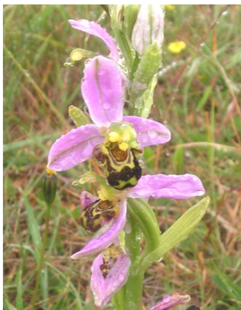
Bee orchid Ophrys apifera , a protected species restricted to two sites on the Island

The purpose of the ASSI system is to safeguard a series of sites which are individually of high natural heritage importance and which collectively represent the diversity of habitats, species and geological and geomorphological features on the Isle of Man. The aim of the Criteria is to provide a logical and consistent basis for site selection, using recognised nature conservation principles. The Criteria also enable Manx sites to be placed in a wider context, so that internationally threatened and vulnerable biodiversity, for which the Island has a shared responsibility, can be taken into account.