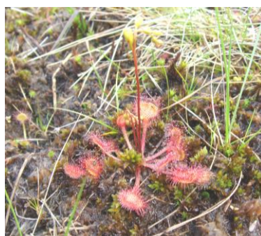
Round-leaved sundew Drosera rotundifolia , on a site managed for its moorland and bog

This aim will be achieved, not just by identifying and designating a suitable series of ASSIs as "areas on a map", but also by working with landowners and users to help them undertake the best management for the Island's most important wildlife sites.