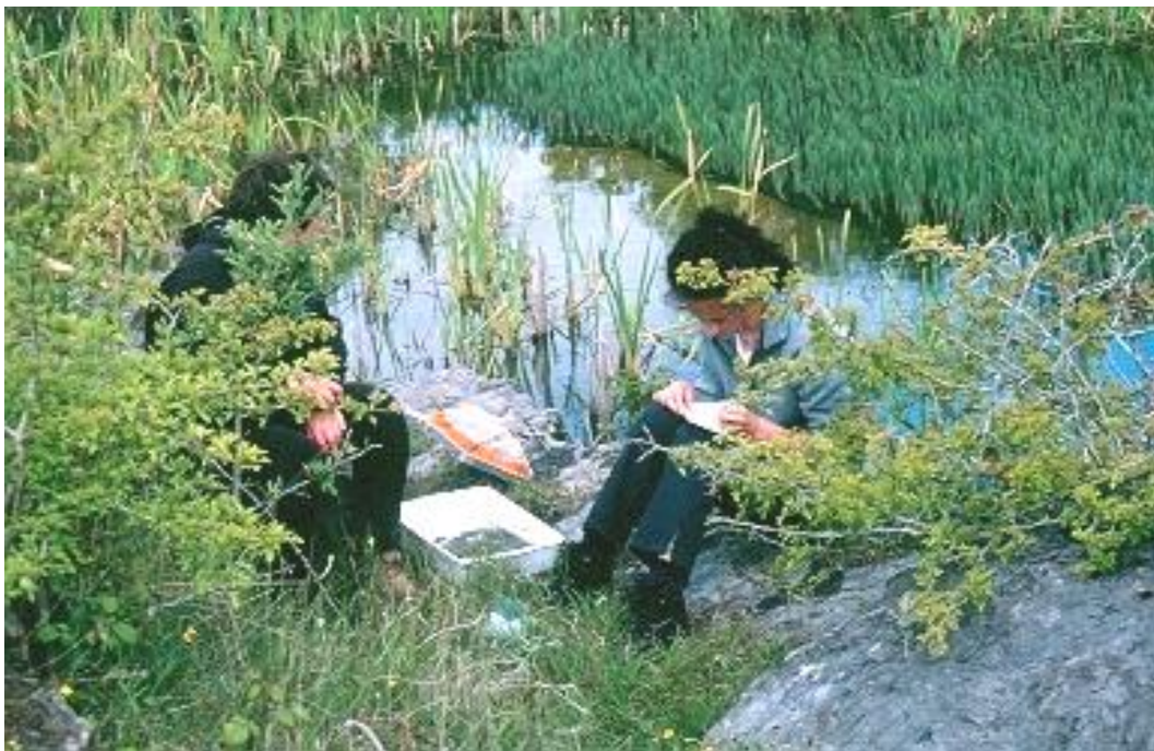
Surveying ponds at Rosehill Quarry, Billown, prior to ASSI assessment; the site was subsequently selected as an ASSI, and designated in December 2005.

In 1989 the then Nature Conservancy Council (now the Joint Nature Conservation Committee) published a detailed set of criteria for selecting Sites of Special Scientific Interest in the UK. With a lengthy introduction and rationale based on the "Ratcliffe criteria" (see above), the detailed guidelines cover all the habitat types and species groups which at the time were considered relevant to the selection of protected sites. Each habitat and species group is given its own chapter, with a description, classification information and specific guidance on the minimum criteria for site selection. These chapters are periodically updated as new information becomes available. This widely-used approach has been followed in Parts 3 and 4 of this document, entitled Priority Sites Criteria and Detailed Selection Guidelines .