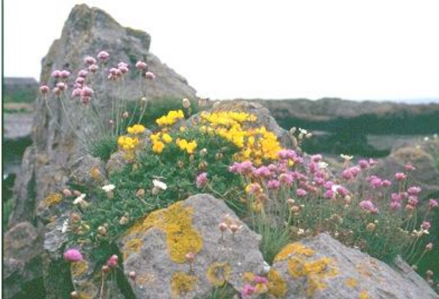
Patches of coastal grassland at Poyll Vaaish ASSI form part of a series of interrelated coastal habitats