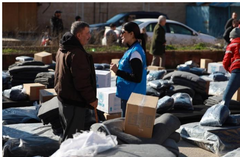
UNHCR provides assistance for earthquake-affected families in Hama.