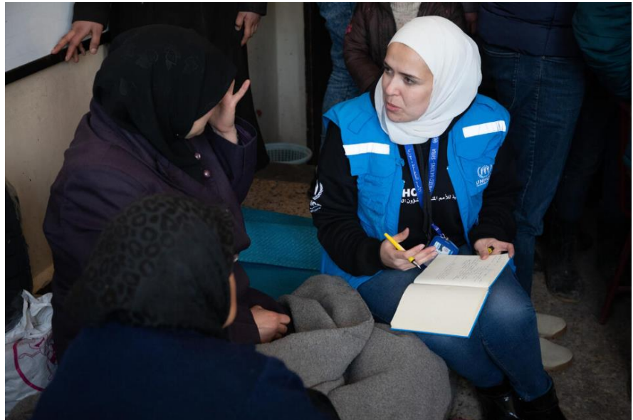
Earthquake survivors speak to UNHCR staff in Aleppo.