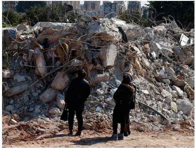
People walk by ruins in central Latakia, Syria.

impacted. The magnitude of the earthquake has mainly affected the north, central, and the coastal parts of Syria, with severe human and material damages reported, mainly in Aleppo, Hama, and Latakia Governorates, and impacting almost every person living in northwest Syria. Prior to the earthquakes, in north-west Syria alone, 4.1 million people depend on lifesaving humanitarian assistance, which includes an estimated 2.9 million internally displaced people, some living in tents, flimsy shelters and under difficult conditions. The majority are women and children.