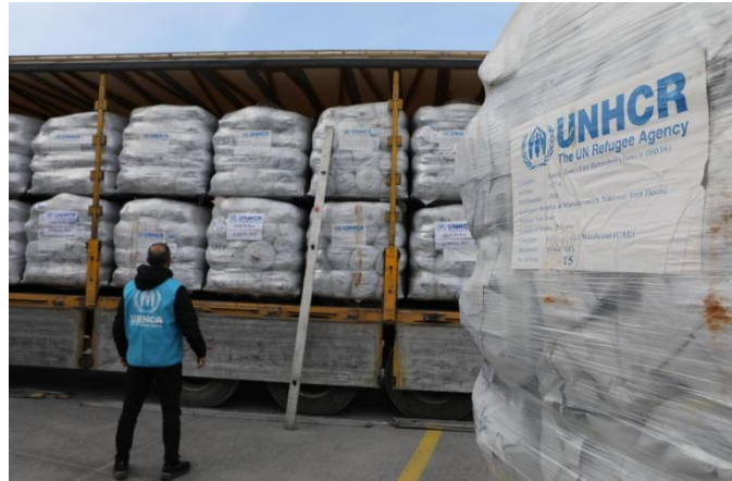
UNHCR's thermal blankets and tents are loaded onto trucks in Türkiye.