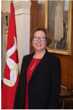
Hon. Jane Poole-Wilson, MHK MINISTER FOR JUSTICE AND HOME AFFAIRS

Under the Police Act 1993 the Department of Home Affairs, after consultation with the Chief Constable, determines the objectives and strategic priorities of the Isle of Man Constabulary. These are determined annually and a report is then laid before Tynwald. This enables Government to provide high-level direction to the Constabulary without impacting on their operational independence.