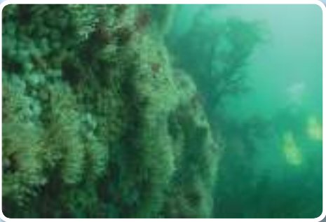
Rocky reef

Rocky reef • Brittlestar beds • Kelp forest • Plaice nursery