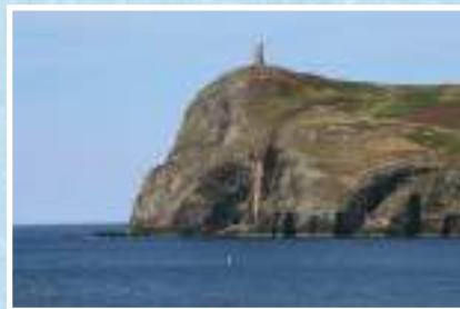
Bradda Head

NNRs are areas protected via specific byelaws to ensure that reserve visitors behave responsibly.