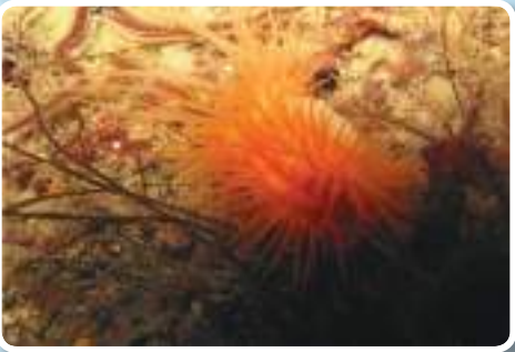
Flame shell

Stalked jellyfish • Iceland clam • Herring Gull