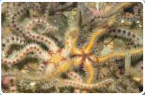
Brittlestar beds

Brittlestars have slender arms that are about 5 times the length of their main body (disk) and can grow up to 20 cm; so they can create large tangled beds of many thousands when they congregate. As suspension filter feeders they hold their arms up in the water column catching plankton. Brittlestars are very fragile and the arms are often broken so it is imperative to prevent mobile fishing gear from being used in areas where they are found.