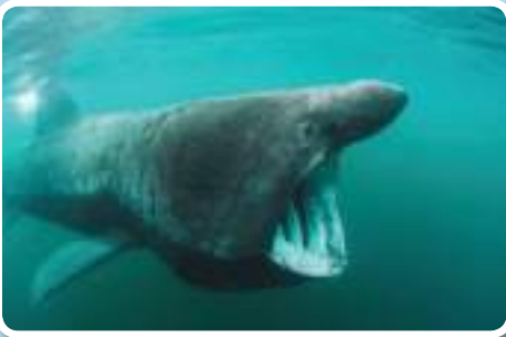
Basking shark feeding

The basking shark is the second-largest fish in the world, feeding on zooplankton (small crustaceans, larvae and fish eggs) that it filters from the water with its gills. As their Manx name, Gobbag Vooar (big mouth) suggests they can strain up to 2000 tonnes of water per hour. Basking sharks have a worldwide distribution and search out plankton blooms in Manx waters from mid-May to the beginning of September.