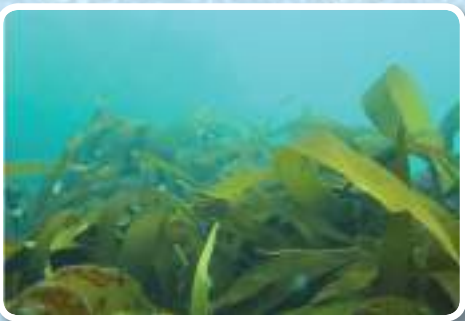
Kelp forest