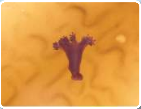
Stalked jellyfish

Kelp seaweeds grow close to shore creating the equivalent of underwater forests. They have similar structures to terrestrial plants; the holdfast (like a root), stipe (like a stem) and blades (like leaves), and establish on hard rock surfaces which they anchor to with the holdfast. Kelp provide a 3D habitat for a diverse range of species; worms, molluscs and crustaceans hide in the holdfast and the blades host bryozoans, juvenile fish and other seaweeds that colonise the surface. Kelp also plays an important role in marine foodwebs, providing a food source for fish, urchins and the beautiful blue-rayed limpet.