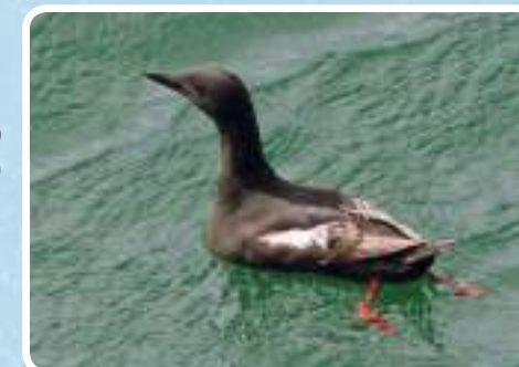
Black guillemot

Coastal cliffs provide a breeding ground and refuge for seabirds such as black guillemots ( Cepphus grylle ) and fulmars ( Fulmarus glacialis ) which feed out at sea for crustaceans and sand eels. Coastal birds, such as choughs ( Pyrrhocorax pyrrhocorax ), use the shore line to forage. Protecting areas of high biodiversity supports natural food webs, without which apex predators, like peregrine falcons ( Falco peregrinus ), would not be able to survive.