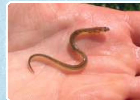
Manx glass eel

spend the next 5-20 years. Their complex life cycle makes them vulnerable to overfishing and other human activities, and the European eel is now considered 'critically endangered'.