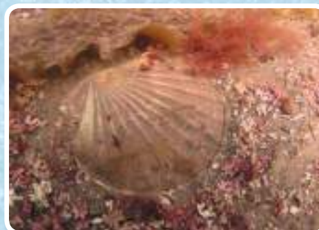
Scallop on maerl

commercial species in Manx waters. Maerl beds play a part in slowing the effects of climate change, by depositing calcium carbonate and acting as a 'blue carbon store'. Excess carbon dioxide emitted by human activities can be taken up by coastal habitats, such as maerl, seagrass and kelp beds, and their destruction leads to captured CO 2 being released back into the atmosphere, so it is vital to conserve them for many reasons.