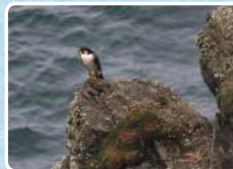
Peregrine falcon

Marine Drive, overlooking Little Ness MNR, provides important coastal habitats for many animal and plant species. Exposed, hard cliffs provide nesting areas for birds such as shags and peregrine falcons, while maritime grasslands support various salt-tolerant plants such as spring squill and Danish scurvy-grass. There are also areas of coastal heath, scrub and exposed rock which provide an abundance of wildlife niches for common lizards, which bask along the roadside, and butterflies such as the dark-green fritillary and the wall-brown.