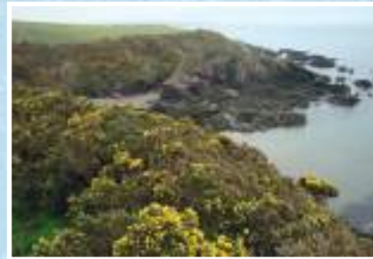
Marine Drive

Marine Drive ASSI and Santon Gorge & Port Soldrick ASSI.