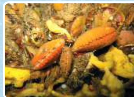
Horse mussel reef

Each horse mussel attaches to the seabed, or neighbour, with strong hair-like threads, called byssus. Over time, as mussel numbers increase, the live animals and empty shells build-up and create biogenic reefs. The reef structure has many crevices providing hiding places for juvenile fish and many other species, and the shell surfaces are colonised by sponges, soft corals, tube worms and barnacles. Within Little Ness MNR, 296 different species have been identified in a single large bucket sample, demonstrating the importance of this habitat for marine life.