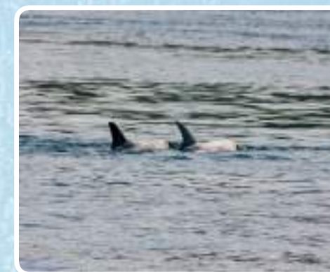
Risso's dolphins

Basking sharks are less frequently seen here compared to the west coast, but keep your eyes peeled between May and September.