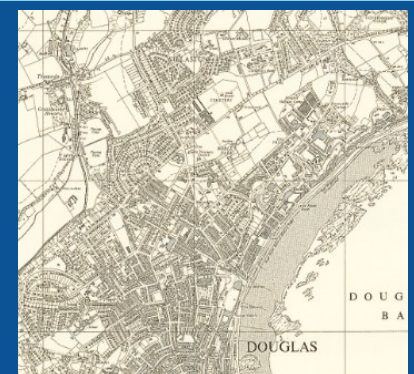
Ordnance Survey 1970's