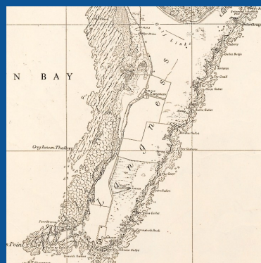
Ordnance Survey 1950's