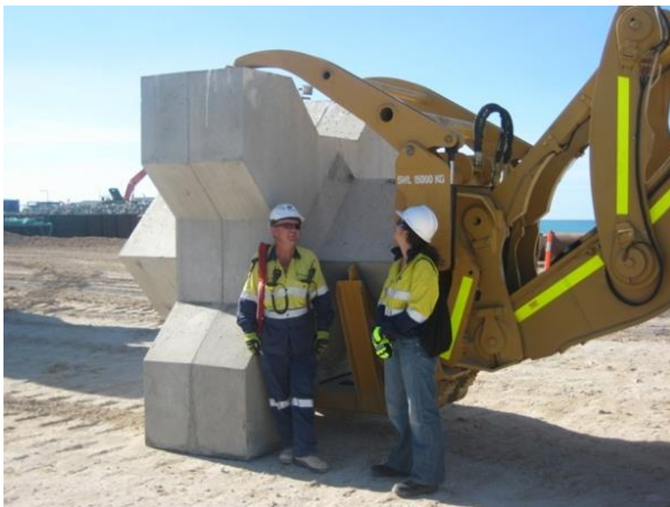
Figure 1 - Xbloc armour unit (DMC, 2011) 7

JBA Project Code 2014s1358 Contract Isle of Man Sea Defence Options Client Department of Infrastructure, Isle of Man Government Day, Date and Time 26/08/2014 Author Alec Dane Subject Gansey – Option GOC2 – Xbloc Revetment