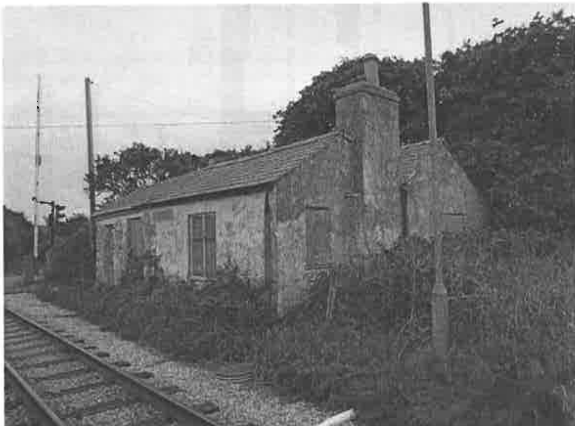
This 2013 view illustrates the rendered extension at the front and rear of the building.