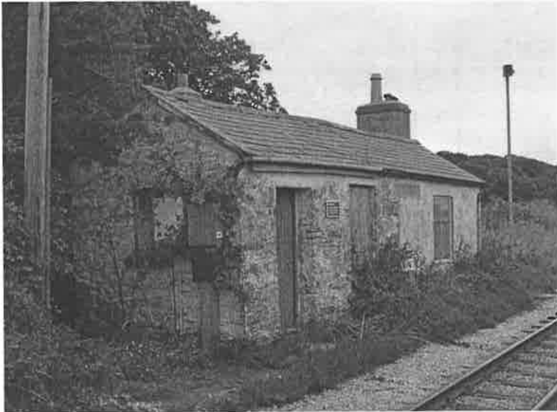
This August 2013 view illustrates the original stone built gatehouse in the foreground with the rendered extension to the right.