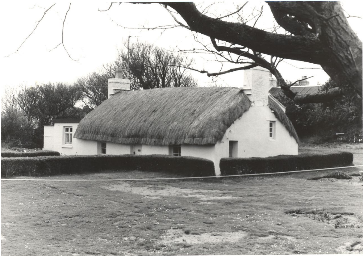
Photographs circa date of registration