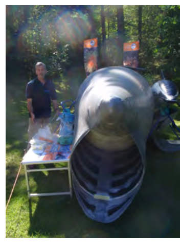
Cool Seas Road Show on Tynwald Day