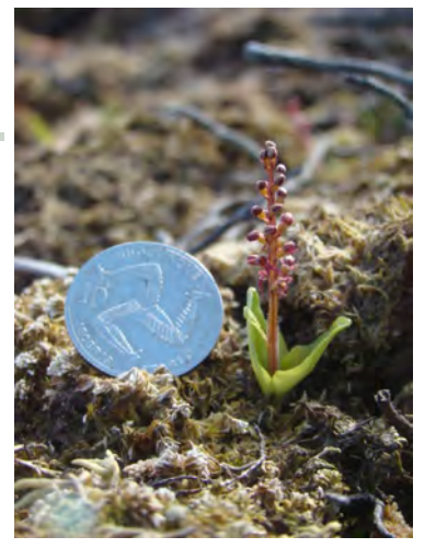
Lesser twayblade orchid Neottia cordata (was Listera cordata) on a bed of sphagnum moss