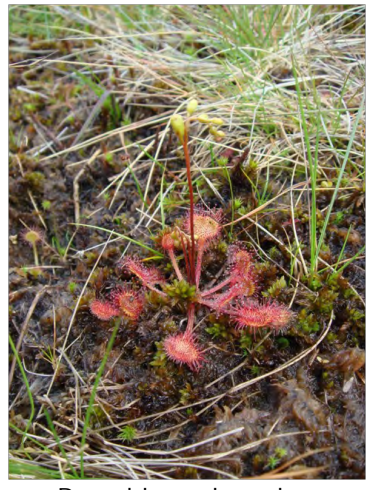
Round-leaved sundew Drosera rotundifolia just coming into flower