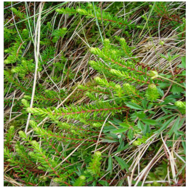
Crowberry Empetrum nigrum growing within the Greeba Mountain and Central Hills ASSI