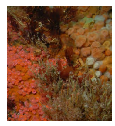
Sea anemones and hydroids