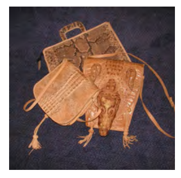
African handbags made of python and crocodile skins