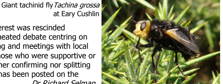
Actual size = 15-19mm