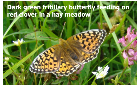
at Tholt v Wil