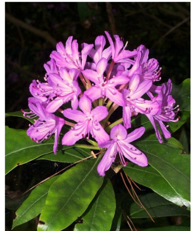
Rhododendron (R. ponticum) is a familiar sight in parks and gardens, but has the potential to invade woodland and moorland habitat.