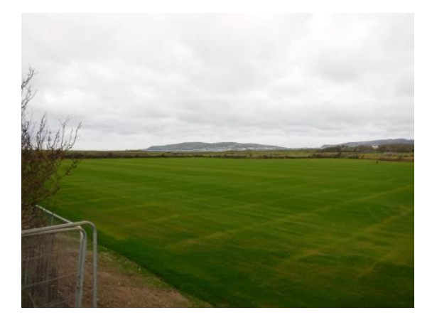
New CRHS playing fields

Work has progressed well on the new Castle Rushen High school playing field project. The pitch plateaus have been formed, with the ground source arrays and drainage installed beneath, and the grassing to the pitches has germinated. Work will continue in 2022, including providing the cricket wicket, the cricket practice nets and fencing to the perimeter, with handover expected August 2022. The next phase will see the development of final designs for the building of the school.