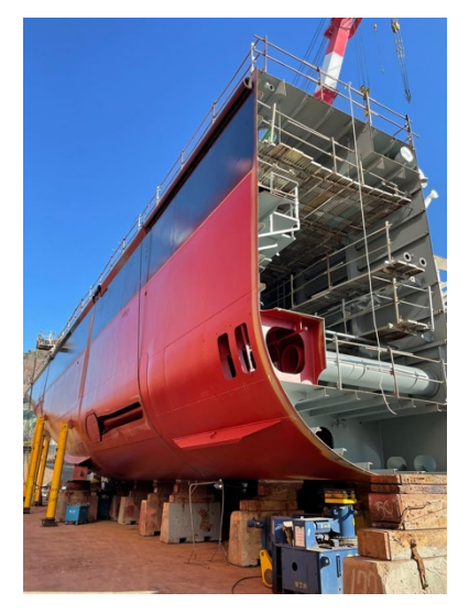
The Manxman construction

A review of financial reporting has commenced and there is a proposal to replace the separate Light Blue Book and Dark Blue Book with a single Annual Report for Government. The format of the Annual Report is the subject of ongoing discussions with key stakeholders. It is also intended that a review of the budgeting process will be undertaken during 2022-23.