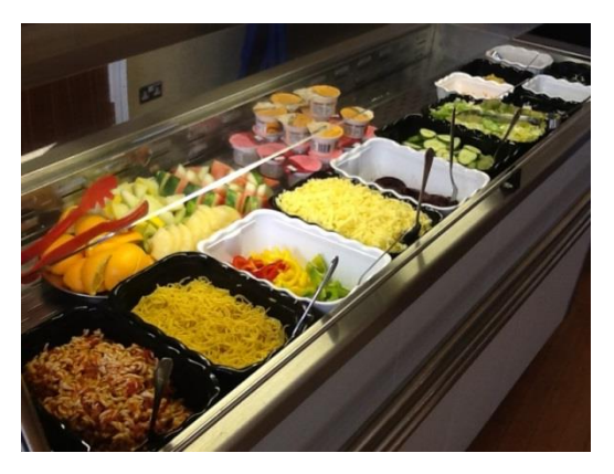
Primary school meals – salad bar

Following the transfer of the school meals service back to the Department, DESC continues to develop the service and in line with the Digital Strategy, primary school meals can be purchased on-line through 'Parent Pay'.