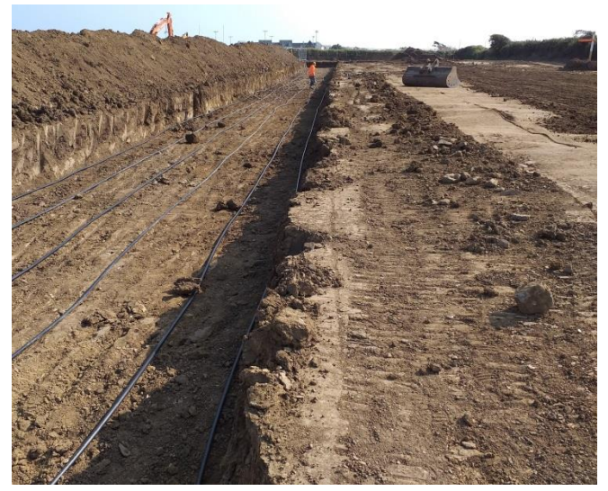
CRHS New Pitches – laying the ground source pipe arrays

The Department's capital programme has continued. Work has started on the new Castle Rushen High School playing field development. Construction will be completed in 2021, and following seeding, the pitches are expected to be playable by September 2022. Work on the design brief for the new school will be completed in 2021.