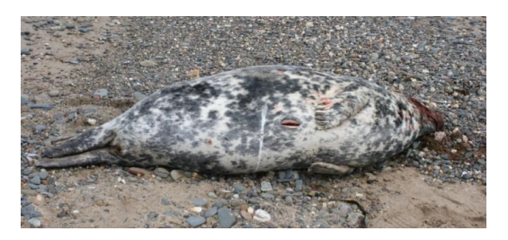
Grey seal: fresh, little scavenger damage.

Stranded animals may be in various states of decomposition and may look different from when alive. These images show examples of Manx strandings.