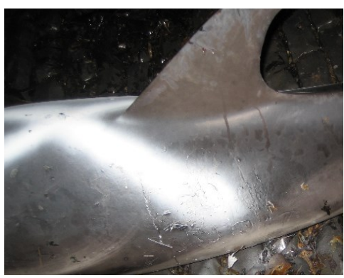
Example of a stranding marked with a white cross.

We rely on public reporting, and often multiple reports are made: where a stranding has already been attended a visible paint mark, e.g. white cross (see image), should be apparent, you don't need to re-report such strandings.