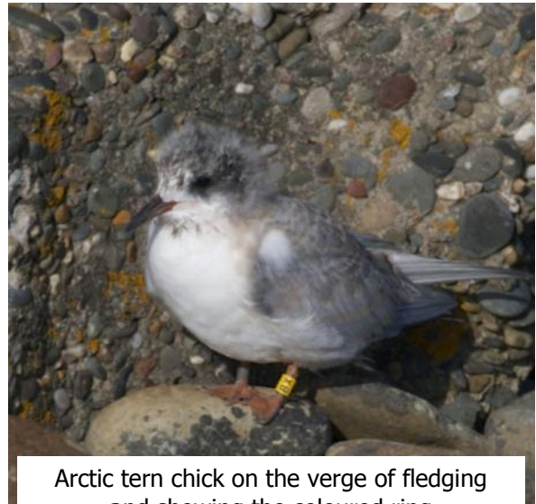
Arctic tern chick on the verge of fledging and showing the coloured ring

Exceptional numbers of little terns have been recorded on the NNR this year with 60 pairs attempting to breed. Unfortunately there has been massive egg predation with many clutches being raided by hedgehogs . This may be an after effect of the tidal storm surges and floods; the floods will have pushed the hedgehogs into the dunes and the heaps of marram grass left by the tidal storm surges have provided perfect day time/nesting cover. So far 17 little terns have fledged and there are still chicks and eggs on the beach and so hopefully more will follow. Rene Beijersbergen, a Dutch researcher, visited the Island in June to collect data on the feeding behaviour of the Manx little tern colony.