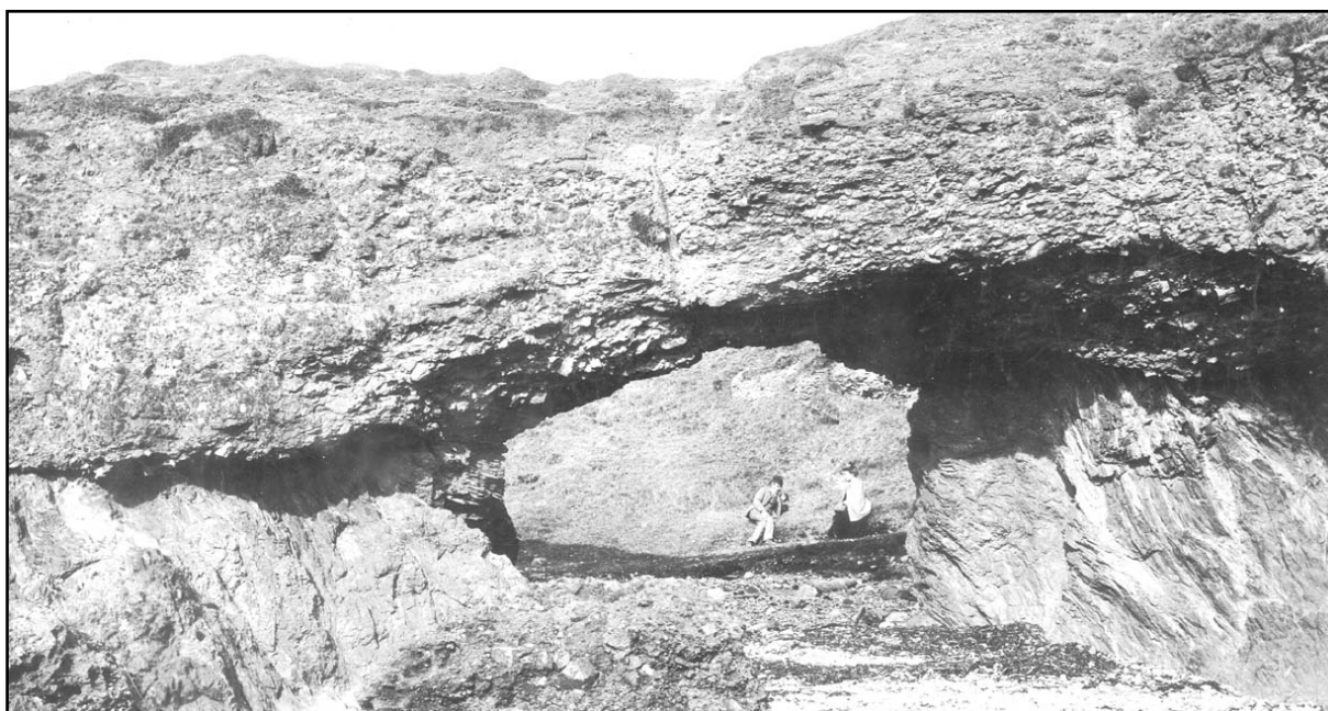
The natural arch at Langness, a popular subject for visitors as depicted in this early 1900s picture [Library Ref: Photographs - Geology]