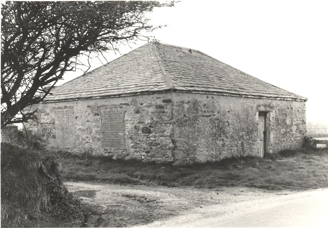
Photographs circa date of registration