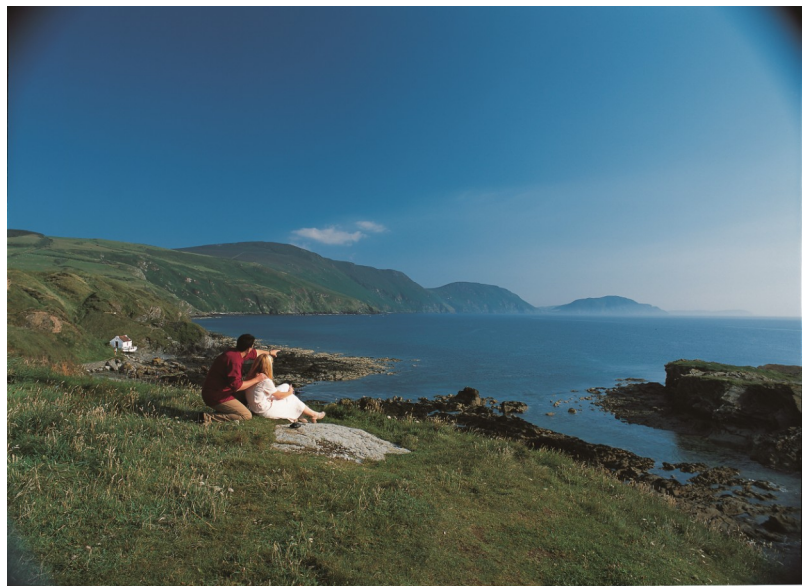
View across Niarbyl

Marine Users are asked to keep the recommended distance away from Marine wildlife and to follow guidelines.