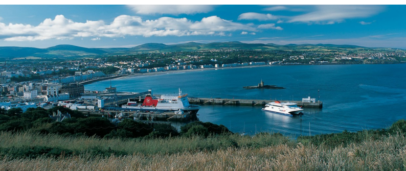
Douglas Harbour and Bay from Douglas Head

The Safe Bathing Area is shoreward of a line joining the Harbour Slip, the Yellow Buoy and the dome on Collinson House.