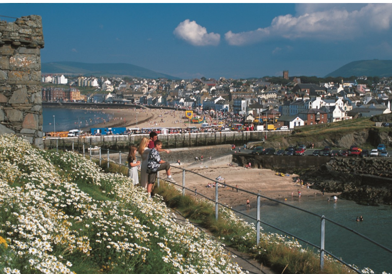
View from Peel Castle

Example of harbours information signage that can be around the harbours. Please consult before launching fast-craft.