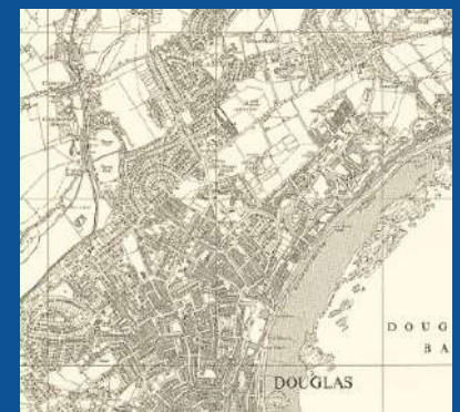
Ordnance Survey 1970's