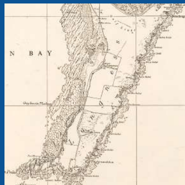
Ordnance Survey 1950's