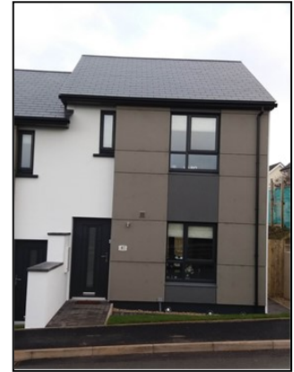
First Time Buyer Home, Ramsey

There are currently two upcoming residential developments which already have planning permission and which will include first time buyer homes at Auldyn Meadows, Ramsey and Reayrt Mie, Ballasalla. Several other sites are also currently going through the planning process.