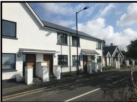
Mid rent homes at Cronk Cullyn

You may also be interested in registering your interest in our Mid Rent pilot scheme.