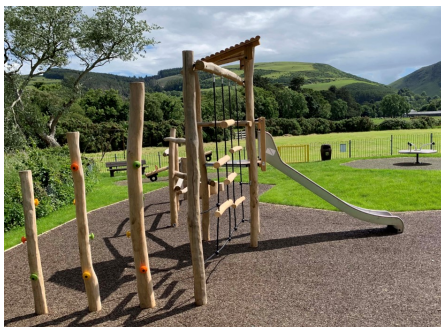
Refurbished playground at the Ballabrooie Estate, Sulby