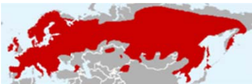
Range map 2

The red squirrel is categorised as of Least Concern by the IUCN 2 , with regard to the species as a whole. It is hunted for fur in some countries. It has a wide range across Europe and Asia. Its survival is not under threat. However, 17 subspecies are recognised 3 , of which the subspecies Sciurus vulgaris leucourus Kerr 1792 is only found in Britain and Ireland and is under threat, particularly in England. However, introductions have affected the genotypes of British red squirrels, which is a topic of research interest.