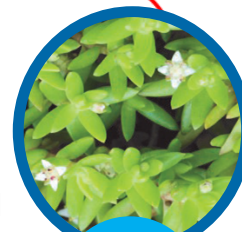
New Zealand Stonecrop

Some invasive species are already present on the Isle of Man. Japanese knotweed can cause damage to roads or buildings and is a problem on some riverbanks. New Zealand stonecrop, a weed that can grow out of control, has been found in some ponds and reservoirs. It is important to stop these species spreading.