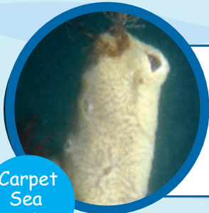
Carpet Sea Squirt

A small freshwater mussel (2-4cm long) which can alter whole ecosystems by forming dense colonies and filtering vast amounts of water.