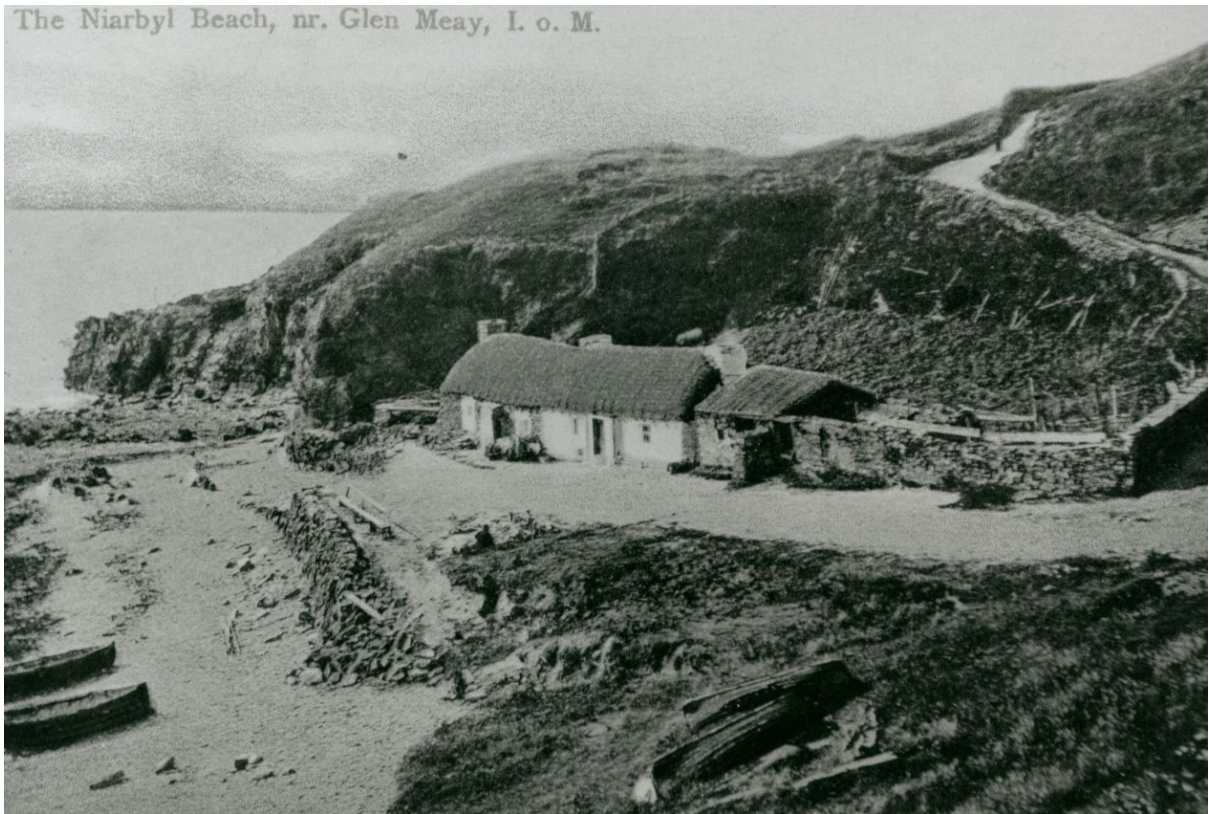
The Niarbyl Beach, nr. Glen Meay, I. o. M.