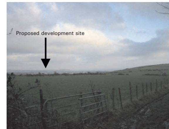
Viewpoint 10: View from Ballacutchel, approximately 1.5km to the southwest of the proposed development site. Views are open and distant.