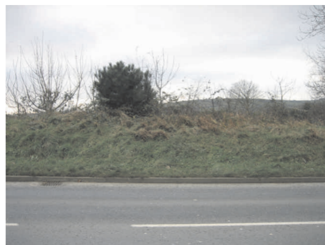
A typical boundary feature along Cooil Road