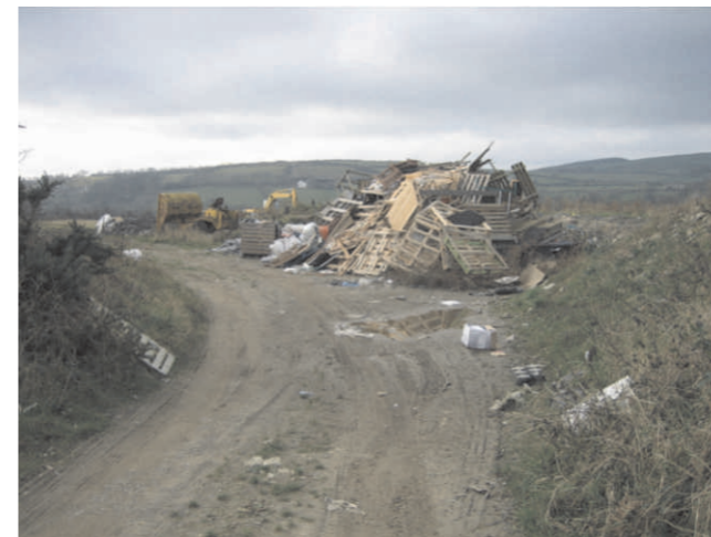
Viewpoint 5: View looking southwest from a storage area adjacent to the central part of the proposed development site. Storage is focused adjacent to existing businesses and is not typical of the site.