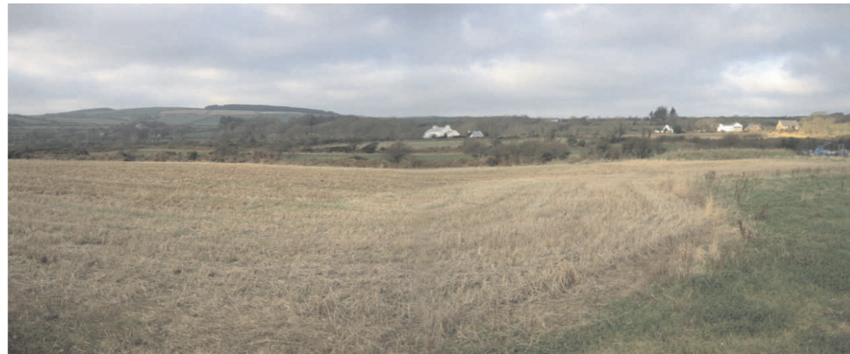
Viewpoint 2: View of the fields in the western corner of the site, looking west toward properties along Colooney's Lane. These include, from left to right, Garey Ashen, Creg-de-Shee, Clybane Cottage and Cooil Methodist Church.