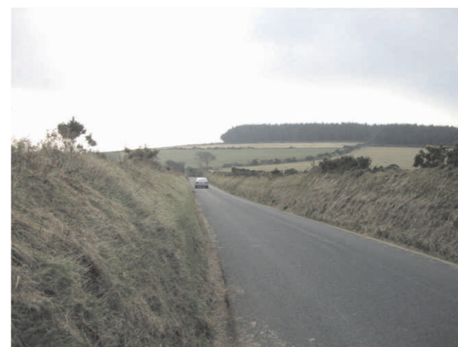
A typical manx hedgerow, earth embankment with vegetation on top