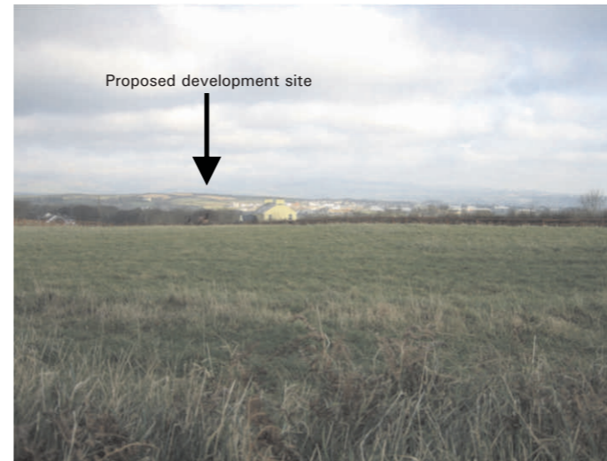
Viewpoint 7: View looking north towards the proposed development site from Rosehill Farm, Richmond Hill. The proposed development site is over 1km distant and views are heavily filtered.