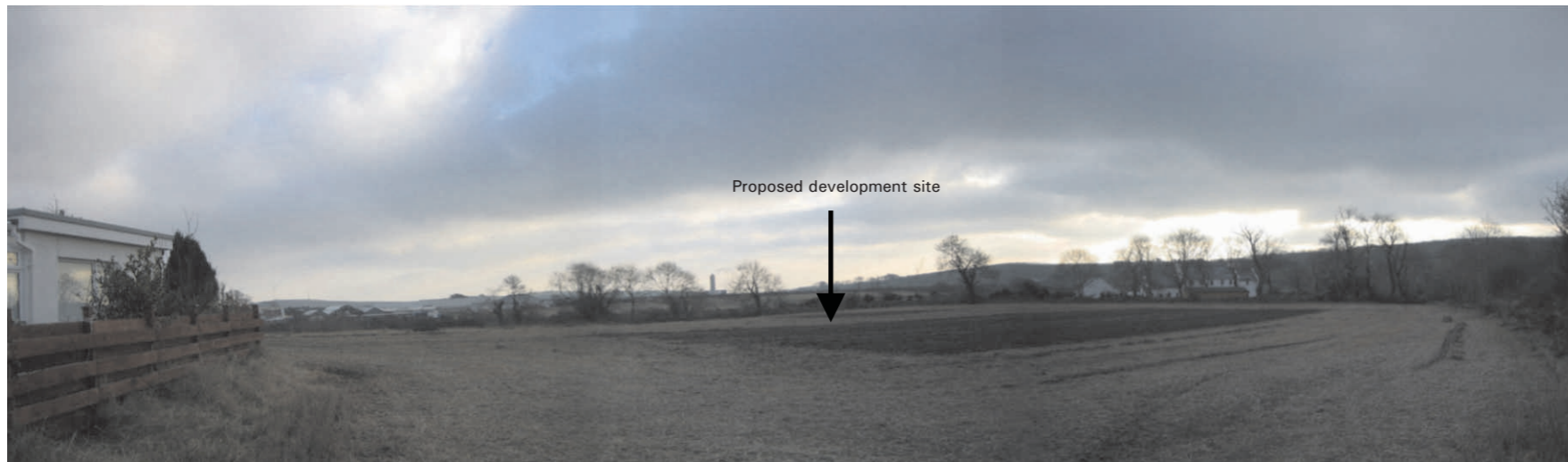
Viewpoint 11: View from Colooney's Lane looking southeast to the proposed development site. Creg-de-Shee is on the left of the view and Garey Ashen is on the right. Views are unrestricted into the northwest corner of the development site.