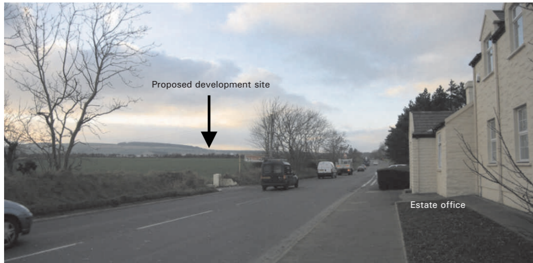
Viewpoint 6: View looking northwest from Coil Road (A6) adjacent to the Estate Office. Open views of the proposed development site are possible. Future views would comprise car showroom and industrial development on the NE corner of the site.