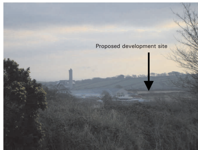
Viewpoint 12: View looking south from Clybane Farm towards the proposed development site. Existing development at Cooil Road and part of the proposed development site is present in views.