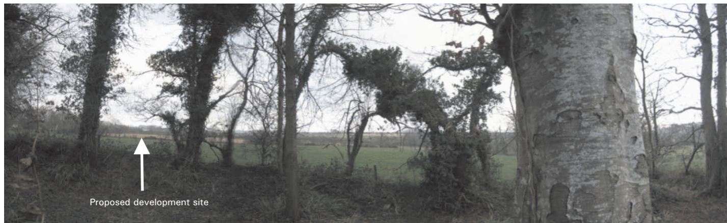
Viewpoint 9: View looking northeast from Colooney's Lane at the end of the drive to Colooney's Farm Cottages at approximately 0.5km from the proposed development site. Views are heavily filtered by roadside trees.