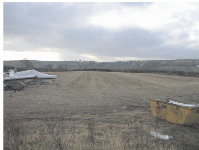
Viewpoint 4: View looking south from land adjacent to Robinson's used for storage. Richmond Hill is in the distance.