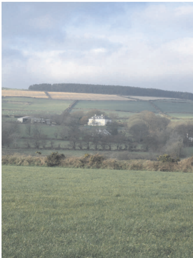
Viewpoint 3: View over the fields in the south west corner of the site towards Kilkenny farmhouse, with Chibbanagh Plantation beyond.