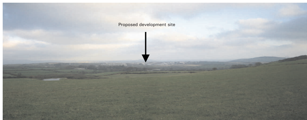
Viewpoint 15: View looking east from the Public Right of Way approximately 300m east of Ballacutchel. Long open views from the northern section of this path are possible towards the proposed development site. The proposed development site comprises a small part of the view. Existing development at Cooil Road is distant in the view.