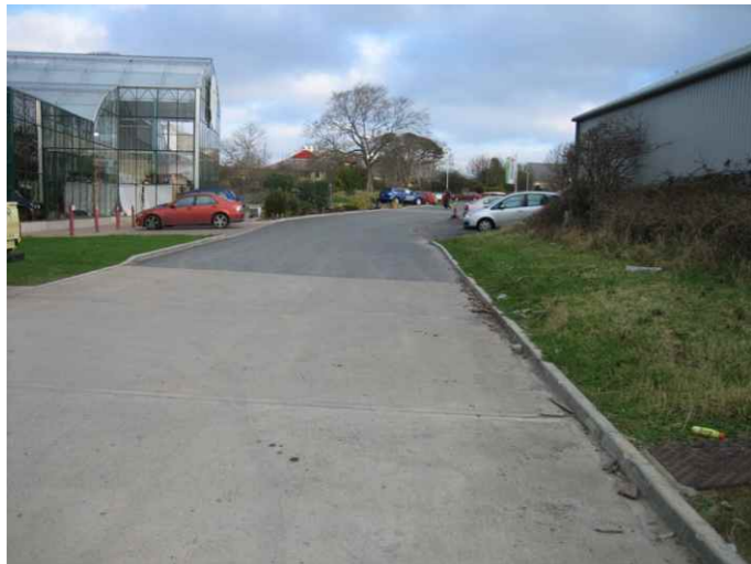
Viewpoint 1: View looking northeast towards Cooil Road from the access road to Eden Park Garden Centre .