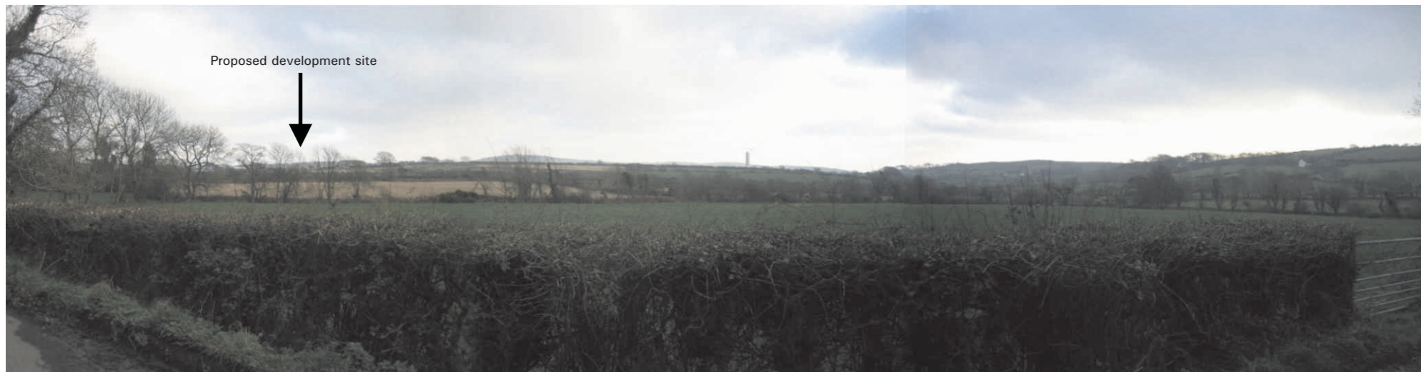
Viewpoint 8: View from Colooney's Lane adjacent to Kilkenny Lodge looking northeast towards the proposed development site 0.5km distant. Views are filtered by roadside vegetation.